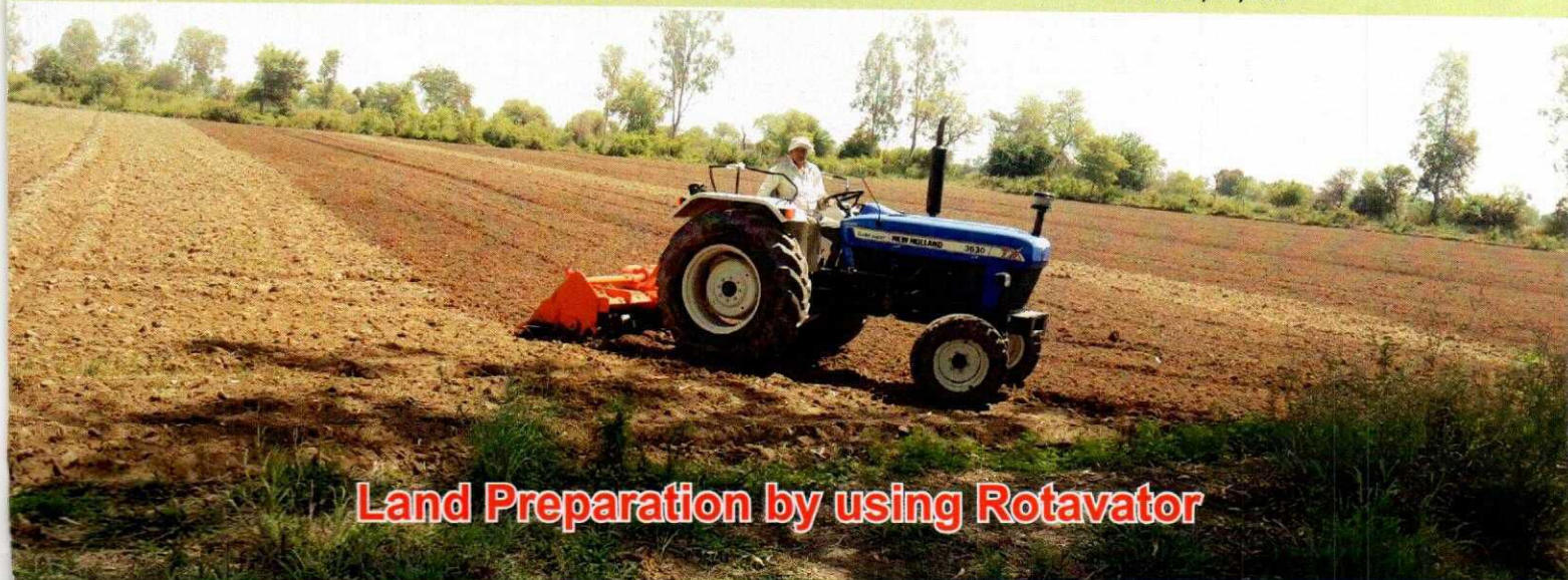
Land Preparation by using Rotavator