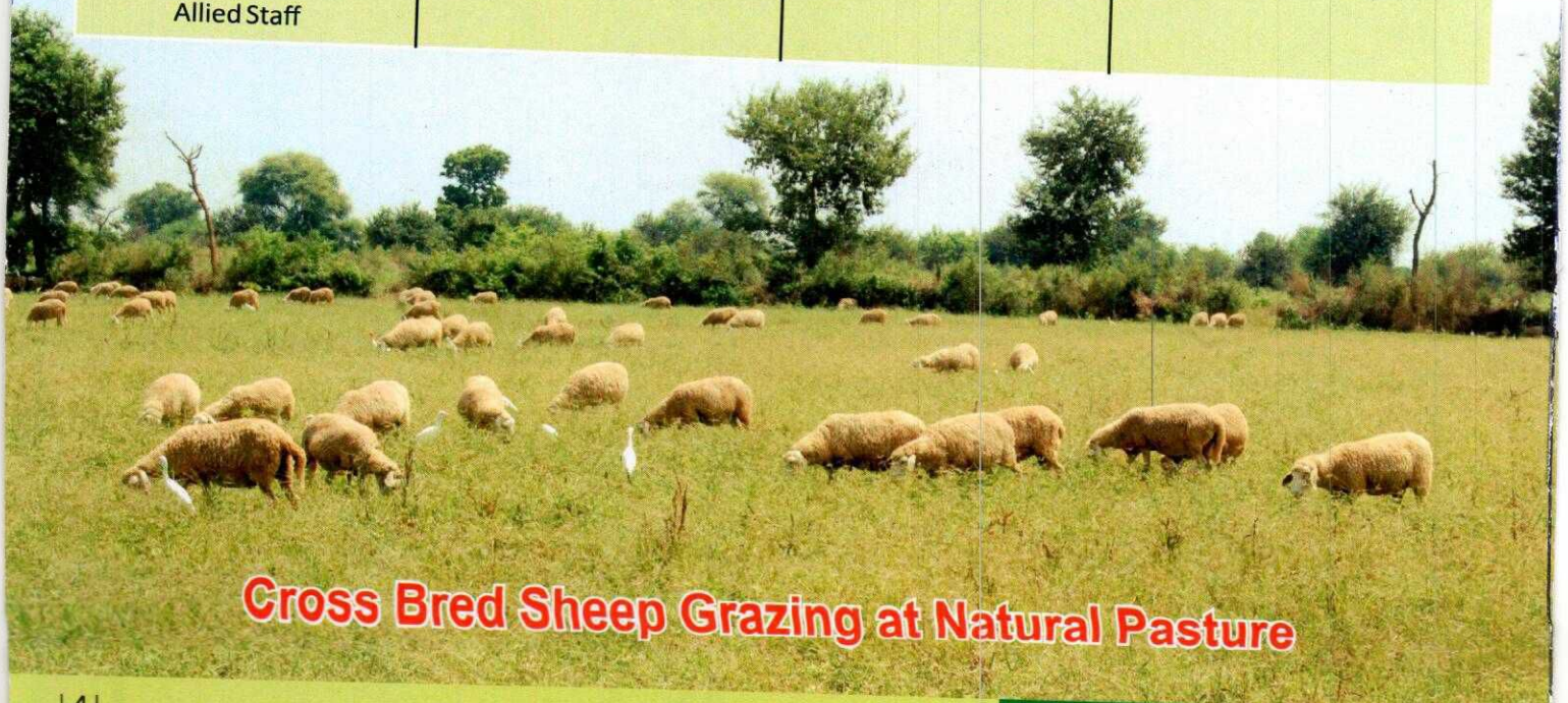
Cross Bred Sheep Grazing at Natural Pasture