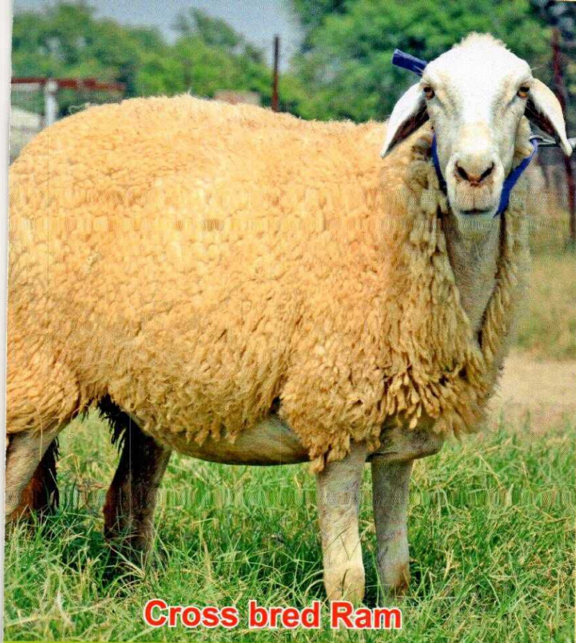
Cross bred Ram